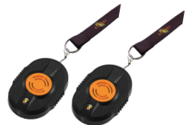
2 Worker badges