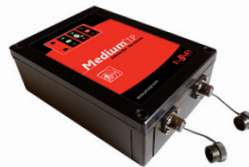
1 BOX antenna