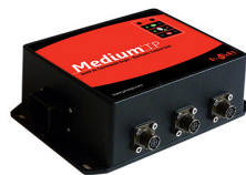
1 Control unit